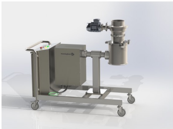
Pre-Breaking before Milling