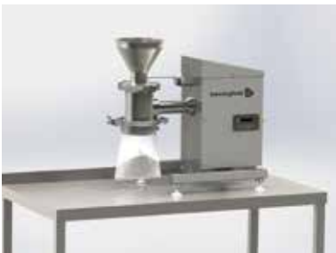
Table Top Laboratory Scale Milling

The Uni-Mill is suitable for isolator integration using our 'through-the-wall' design. This mounts the milling head inside the isolator, whilst keeping motor and controls external.